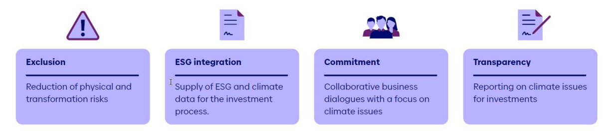
Figure 2: Four pillars of the Baloise Asset Management Climate Strategy

Our climate strategy is based on the four strategic pillars and forms an integral part of the general RI strategy and, therefore, of this policy: